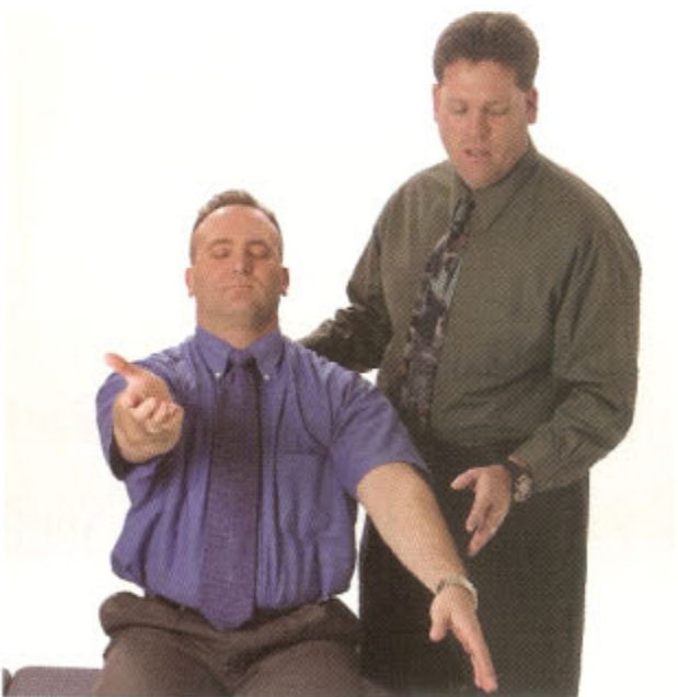
Figure 4. Positive (abnormal) result for the Drift test.

upper-extremity drift. The Cincinnati Scale is a part of stroke identification and emergency procedures taught by the American Heart Association in its course, Basic Life Support (BLS) for Health Care Providers. 6