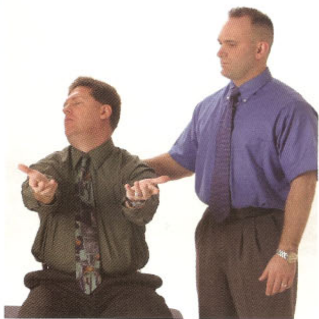
Figure 1. Beginning position and negative (normal) result for Hautant's test.