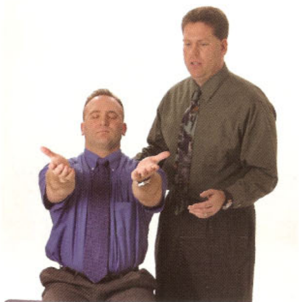
Figure 3. Beginning position and negative (normal) result for the Drift test.