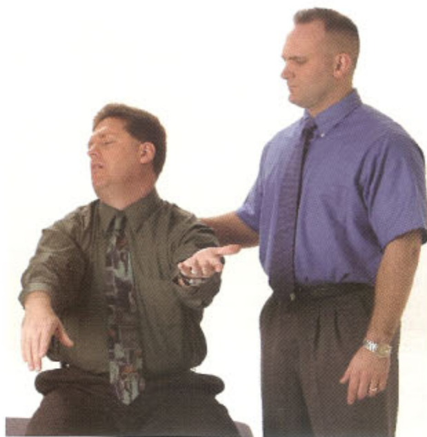
Figure 2. Positive (abnormal) result for Hautant's test.